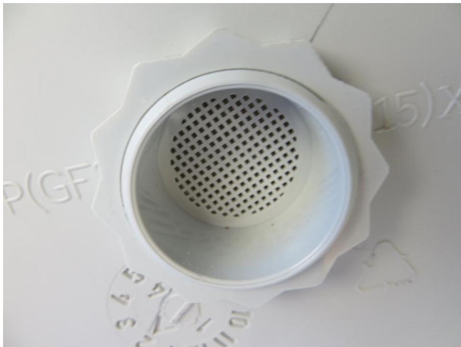
unsignificant penetration of dust around the fitting