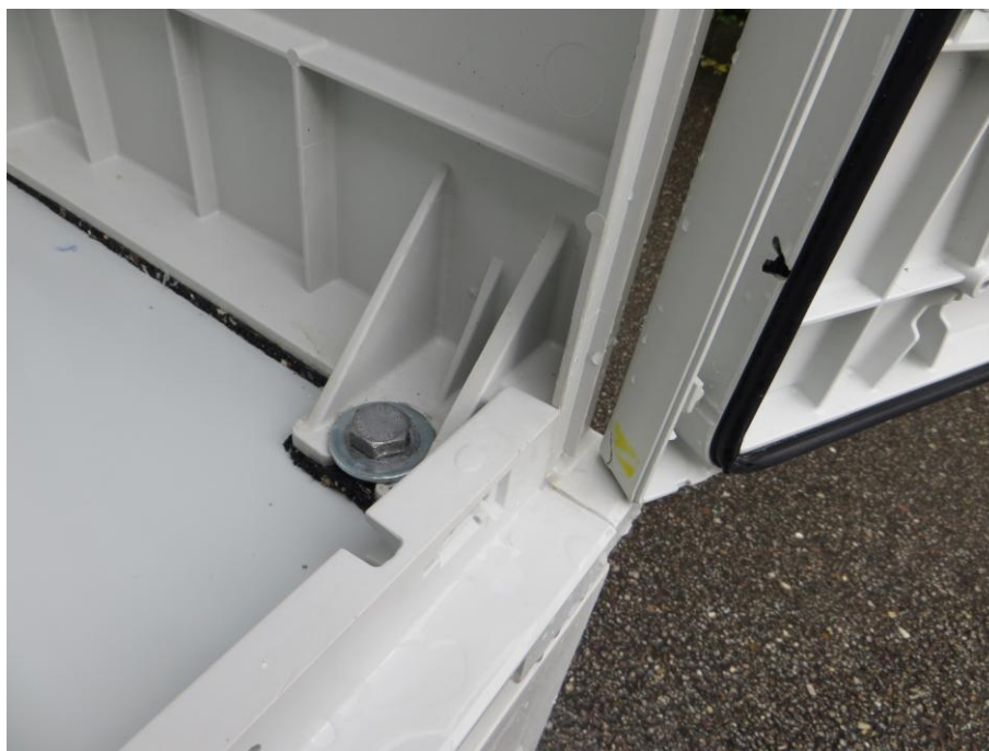
unsignificant penetration of water around the door